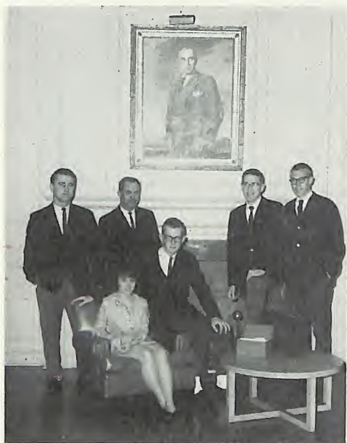
1963-64 Was A Great Year